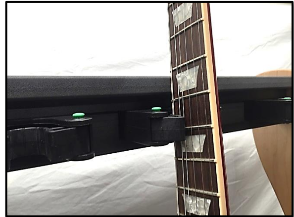
Step 6. Rest weight of guitar on base rails. Press neck gently into neck grips. Grip will 'grab' the neck.