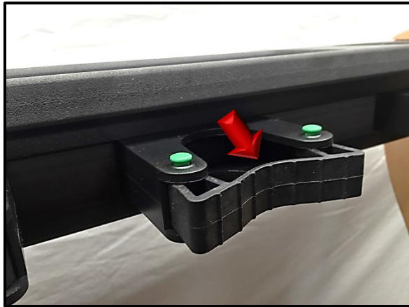
Step 5. Neck grip in "open position." Pull grip open prior to placing guitar neck into grip.