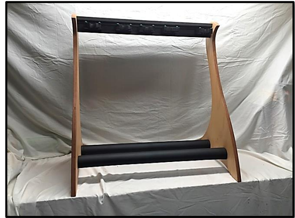
Step 4. Repeat step 3 at remaining locations. Stand is complete and ready for use.