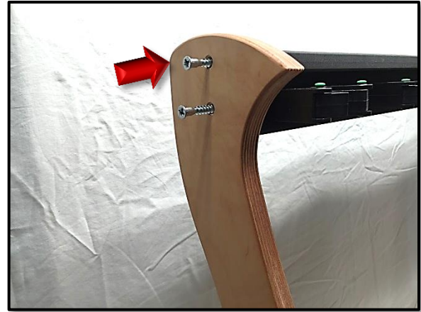
Step 2. Insert T-rail into both legs (lay stand horizontally). Fasten T-rail (2 each side).